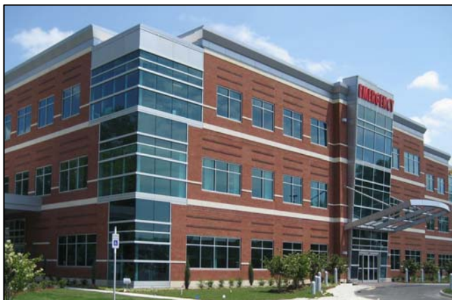
Family Foot and Ankle Care - Sentara BelleHarbour, 3 rd Floor